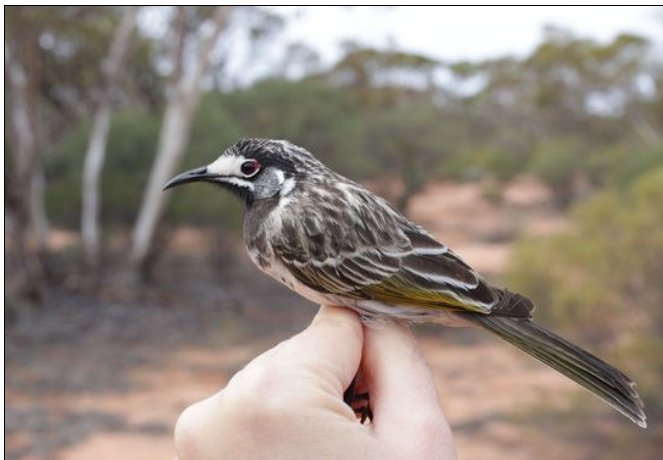
White-fronted Honeyeater ( Purnella albifrons )