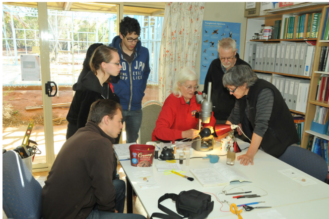
Research and Education

Gluepot Reserve is Australia's largest community managed and operated conservation reserve and is run entirely by volunteers. Situated 64 km from the River Murray in South Australia's Riverland, Gluepot is 54,000 ha. in size, and is home to 18 nationally threatened species of birds, 53 species of reptiles and 12 species of bats, some of which are nationally threatened. There are few areas of the world that support such a concentration of threatened species.