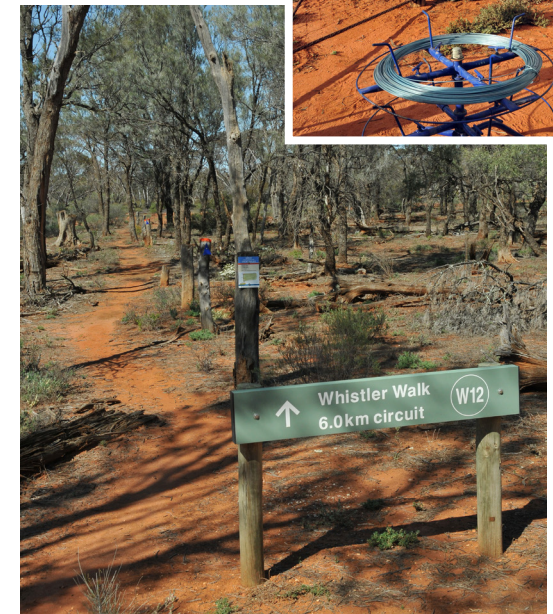
Construction and maintenance of trails and fences