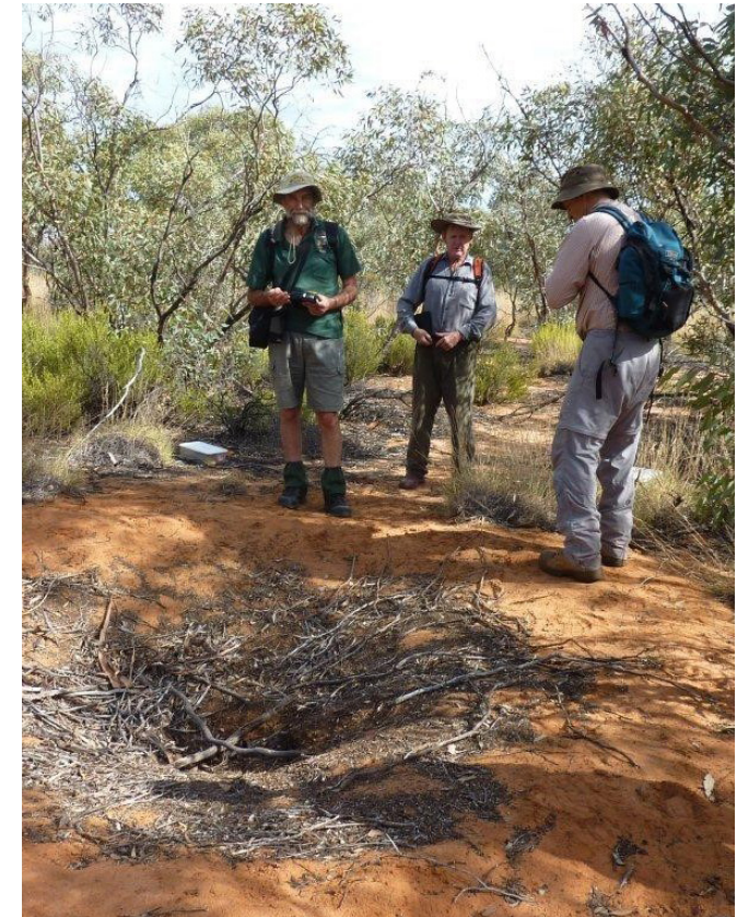
Friends undertaking our annual Malleefowl nest survey